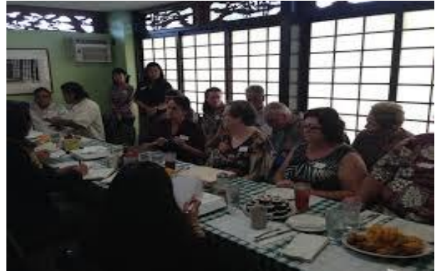
WCCH with Congresswoman Tulsi Gabbard at Dots in Wahiawā